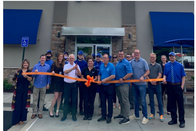
On May 10th, IN WDSK held a ribbon cutting to celebrate the grand opening of Culver's of Woodstock on the corner of Hwy 92 and Neese Rd.