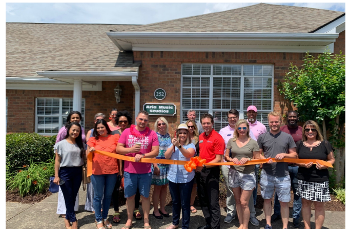
On May 27th, IN WDSTK held a ribbon cutting to celebrate the grand opening of Aria Music Studios, Inc. new location in Woodstock.