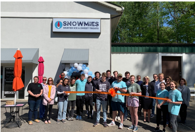
IN WDSK held a ribbon cutting for Snowmies Shaved Ice and Sweet Treats to celebrate their 1 year anniversary. Snowmies is a family-owned business located right off the walking path in Downtown Woodstock, just down the hill from the new Reeves House.