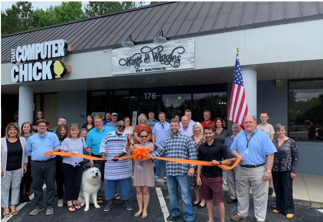
On June 7th, IN WDSTK held a ribbon cutting to celebrate the grand opening of Wags & Wiggles Pet Boutique in Downtown Woodstock.