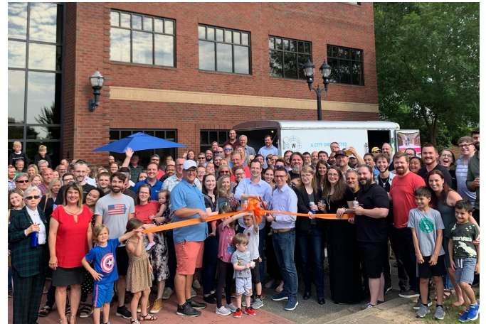
On June 4th, IN WDSTK held a ribbon cutting ceremony to celebrate the new location for Black Airplane in Downtown Woodstock.