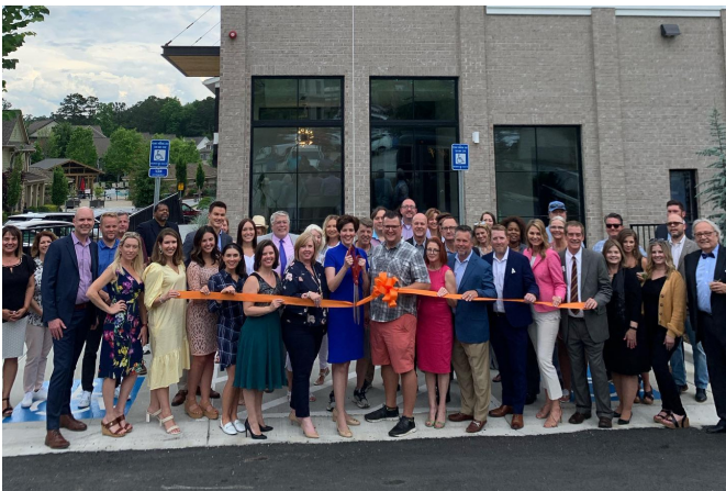
On June 3rd, IN WDSTK held a ribbon cutting ceremony to celebrate the grand opening of Harry Norman, Realtors Woodstock on Fowler Street in Downtown Woodstock.