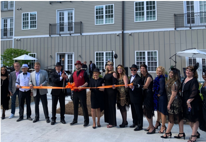
On May 13th, IN WDSK held a ribbon cutting to celebrate the grand opening of Holbrook Woodstock. Not your average adult community, Holbrook exists to inspire wonder in their residents and the world around them.