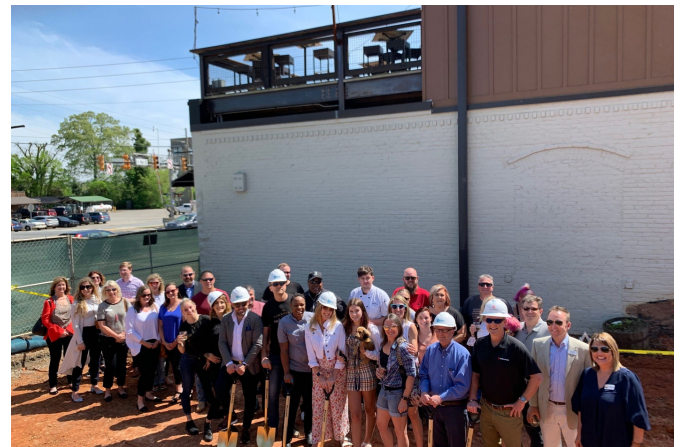
IN WDSK held a ground breaking ceremony April 15th for Rootstock to celebrate their business expansion! We are so excited for Rootstock as they are growing and adding to their existing location right in the heart of Downtown Woodstock at 8558 Main St.